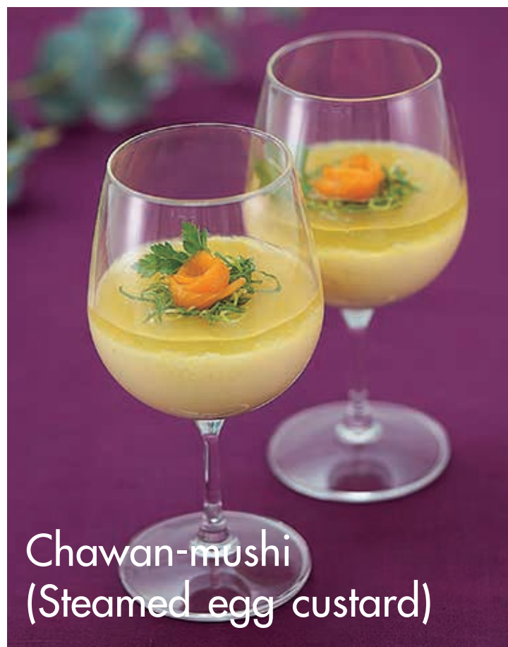
Chawan-mushi (Steamed egg custard)

new HFG-370-R C/T24 098442 φ 85 · H 170 top opening diameter 65 full capacity 370ml