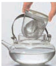
Setup the ice holder.