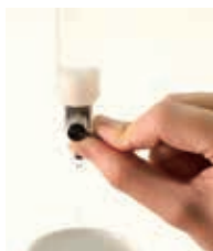
Push up on the knob. ※ IDC-4SV