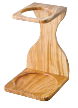
VSS-1-OV C/T6 021204 W145 • D160 • H230