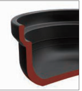
The thick bottom of the rice cooker will adjust the heat that is transferred to the rice.