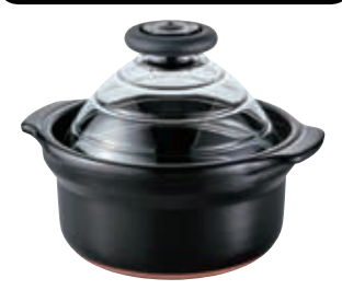
GNN-200B C/T4 803831 W270 • D230 • H210 top opening diameter 200 for 6 servings