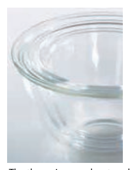
The three sizes can be stored by fitting them inside each other.

A deep design that makes the mixing process easier. The size capacity fits plenty, and with a smaller diameter, you can store compactly. Furthermore, the three sizes can be stored by fitting them inside each other.