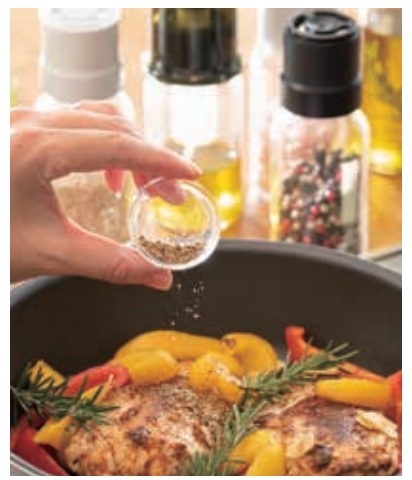
As spices can be stored in the lid, they can be protected from moisture.

Since ground spices can be stored in the lid, you can see the quantity to be used. While cooking, spices are protected from moisture such as steam from cookware. The body is made of heatproof glass resistant to spread of color or odor. The mill is used for rock salt, whole pepper, dried garlic, and other spices.