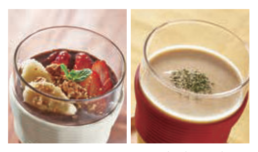
Comes with 10 recipes including a perfect for breakfast acai bowl and a warm pumpkin soup.