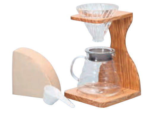
VSS-1206-OV C/T6 021259 W156 • D160 • H248 includes 100 sheets of VCF-02M