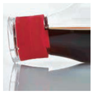
Difficult to spill even when tipped over.