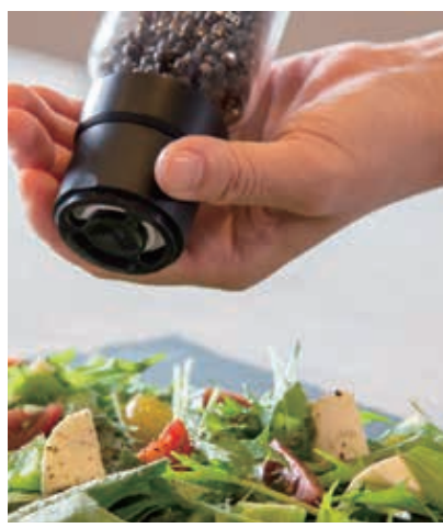
You can directly sprinkle your favorite spices whether pepper or dried garlic.