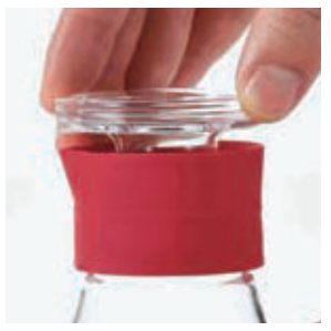
Open by lifting up on the lid.